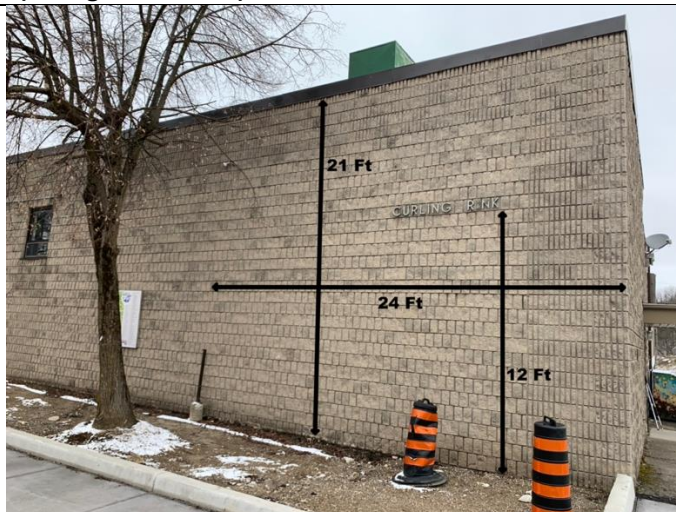
Arena West Facing Wall (Facing Queen St N)