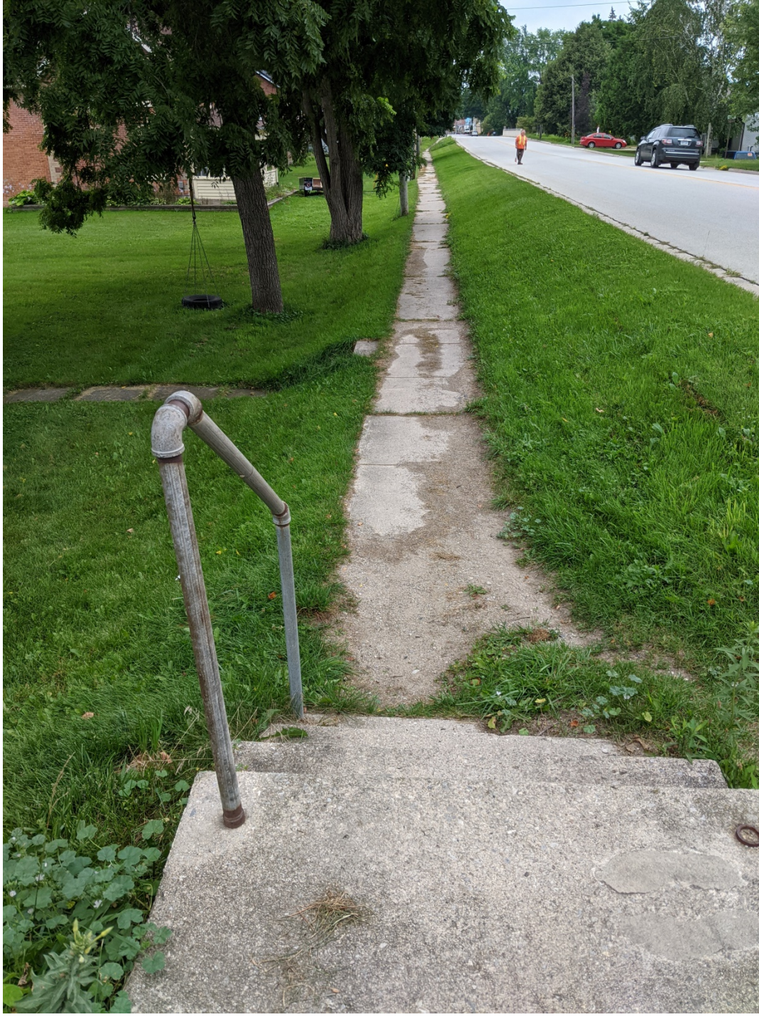
Figure 3 - The Problem Steps Looking South – Corner of Queen Street North and Orchard Street.