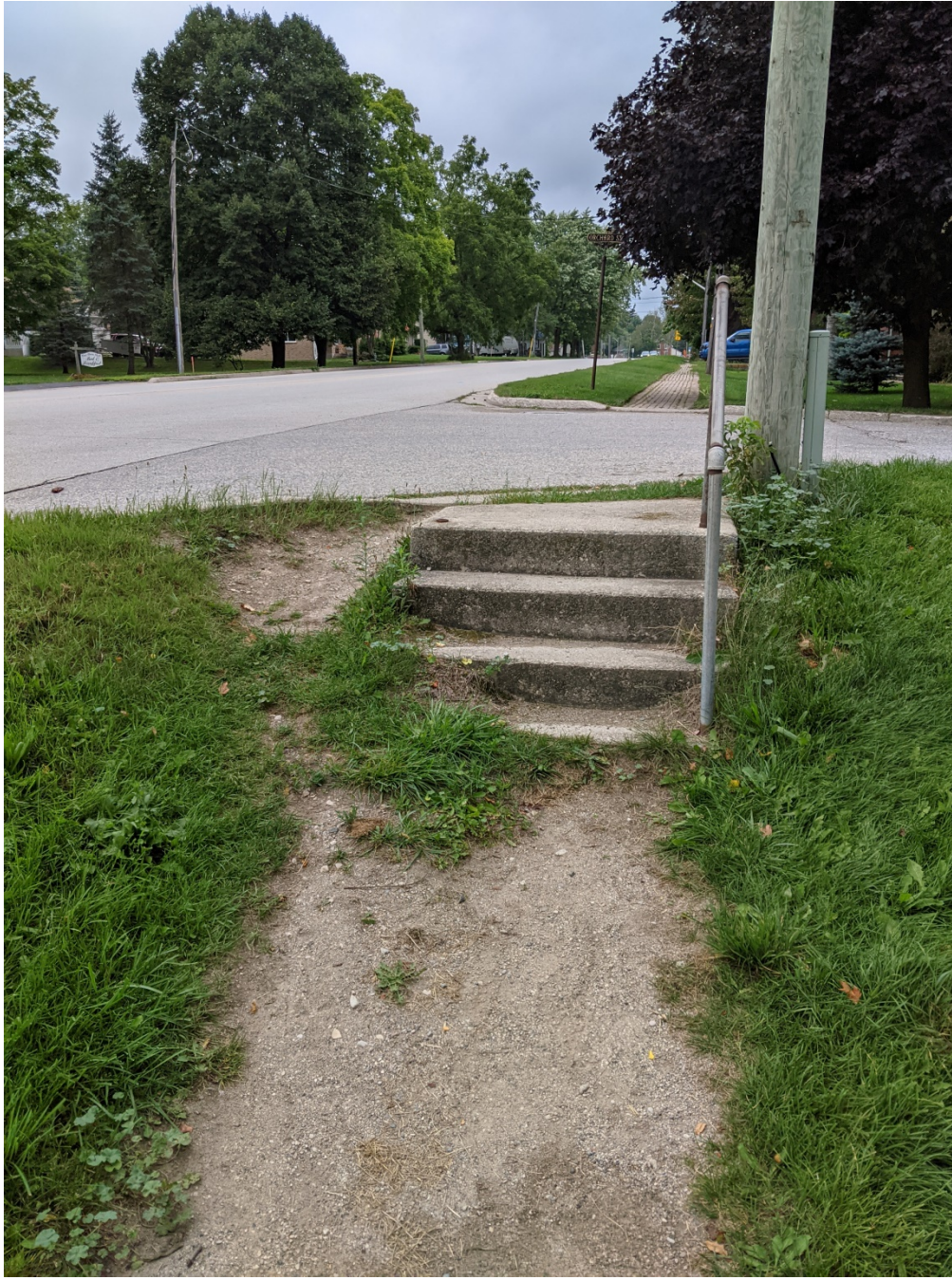
Figure 2 - The Problem Steps Looking North – Corner of Queen Street North and Orchard Street.