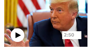
VIDEO What to expect in the first 100 days of Trump's 2nd term