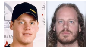
FBI says tips coming in on whereabouts of fugitive Canadian ex-Olympian Ryan Wedding