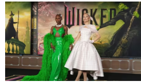
Mattel apologizes for mistakenly printing porn website on Wicked toy doll packaging