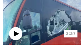
VIDEO Gatineau couple's road trip takes violent turn