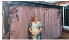
Long list of rules pits Mississauga neighbours against townhouse board