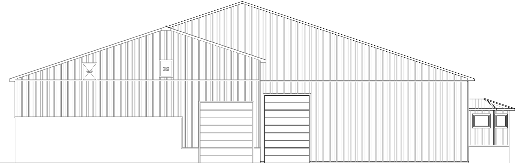
WEST ELEVATION SCALE: 3/16"=1'-0" NOTE: 11 x 17 PRINTS ARE HALF-SCALE, 24 x 36 PRINTS ARE FULL-SCALE